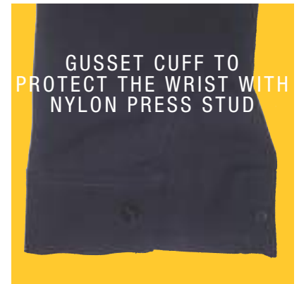
GUSSET CUFF TO PROTECT THE WRIST WITH NYLON PRESS STUD